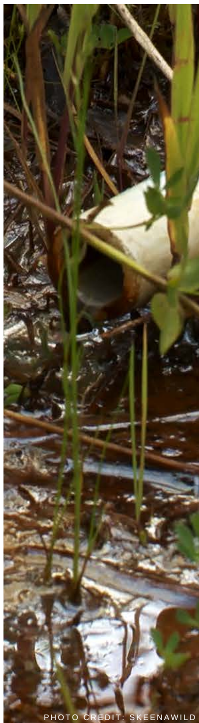
DISCHARGE PIPE FOR UNTREATED MINE-IMPACTED WATER AT GRANISLE MINE