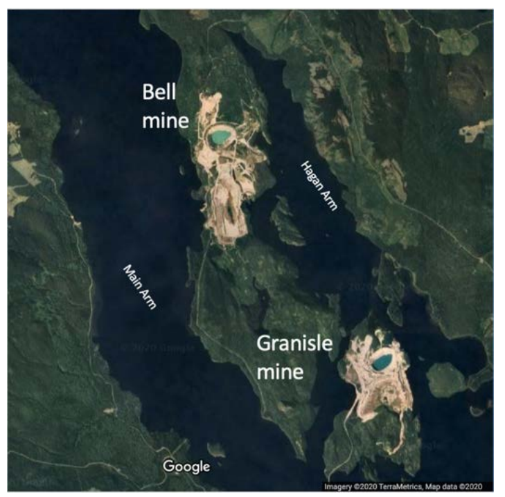
FIGURE 1. BELL AND GRANISLE MINES, TWO DECOMMISSIONED OPEN-PIT COPPER MINES LOCATED ON BABINE LAKE.

Acid rock drainage (ARD) and associated leaching of metal contaminants – particularly copper (Cu), iron (Fe), and zinc (Zn) – are generated by all mine components at both sites, including rock dumps, tailings dams, and mill sites (Remington 1996). Historically, both mines discharged untreated ARD and other contaminated water (elevated in metals and sulphate (SO<sub>4</sub>)) directly into Babine Lake; in 1996, permitted discharge volumes were 9,000 m<sup>3</sup> and 4,100 m<sup>3</sup> per day for Bell and Granisle mines, respectively (Remington 1996). Negative effects to Babine Lake were attributed to these mine discharges during mining operations, including elevated metals (e.g., Cu, Fe, Zn, and aluminum (Al)) and other contaminants (e.g., SO<sub>4</sub>) in surface water and/or sediment surrounding the mines, as well as elevated Cu, Zn, and cadmium (Cd) in fish tissues compared to fish from unpolluted lakes in BC (Remington 1996).