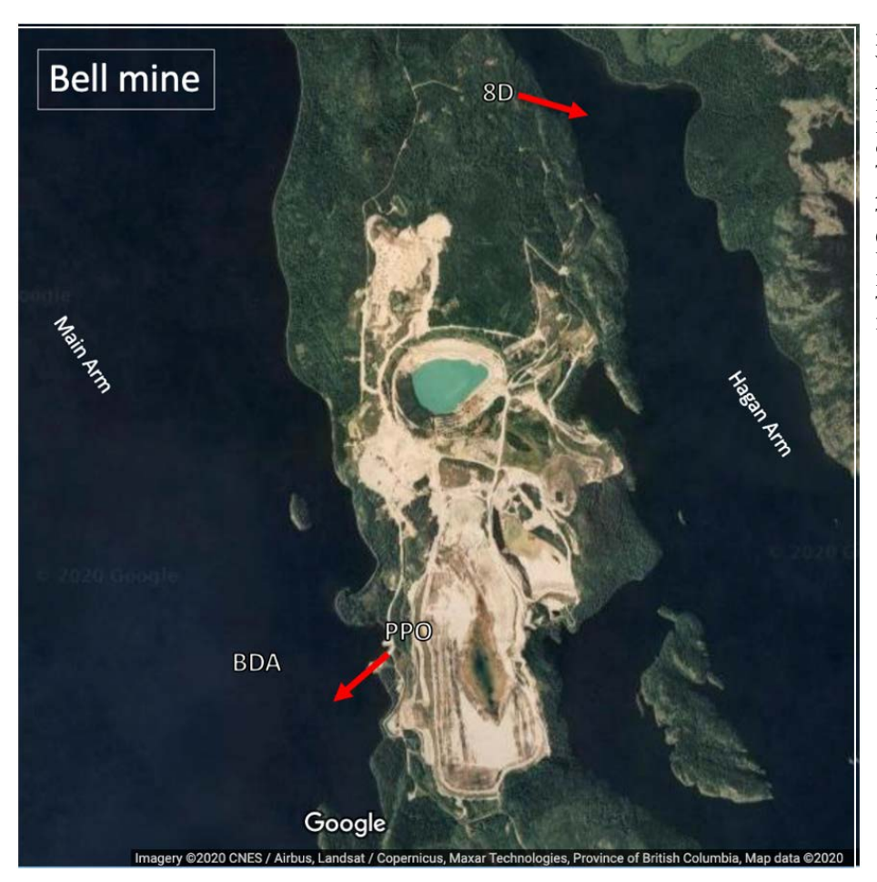
FIGURE 2. MINE-IMPACTED WATER DISCHARGES (RED ARROWS) FROM BELL MINE INTO BABINE LAKE. POLISHING POND OUTFLOW (PPO) IS TREATED WATER THAT ACTIVELY DISCHARGES TO THE BELL DIFFUSER AREA (BDA); 8D DISCHARGE IS UNTREATED WATER THAT PASSIVELY DISCHARGES TO THE NORTH END OF HAGAN ARM.

The Bell mine waste-water treatment plant releases treated water to a polishing pond. Polishing Pond Outflow is excess water from the polishing pond that is actively discharged to the Bell Diffuser Area in Babine Lake on the west side of Newman Peninsula (Figure 2). Untreated runoff, potentially containing ARD, passively discharges from a site called 8D on the Bell mine site into the north end of Hagan Arm in Babine Lake (Figure 2).