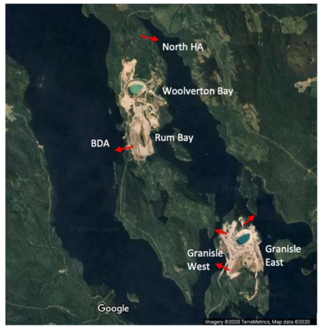
FIGURE 4. RECEIVING AREA SITES IN BABINE LAKE WHERE AQUATIC MONITORING IS PERFORMED: BELL DIFFUSER AREA (BDA); NORTH HAGAN ARM (NORTH HA), WOOLVERTON BAY, AND RUM BAY IN THE HAGAN ARM RECEIVING AREA; AND GRANISLE EAST AND GRANISLE WEST IN THE GRANISLE VICINITY RECEIVING AREA. RED ARROWS INDICATE SOURCES OF CURRENT MINE DISCHARGES INTO BABINE LAKE.

Glencore compares mine-affected conditions in Babine Lake receiving areas to conditions at reference sites (i.e., areas of Babine Lake unlikely to be affected by mine activities), provincial guidelines – which can be insensitive to sublethal effects and/or effects of combined contaminants on salmonids (Price 2013), and historical site conditions.