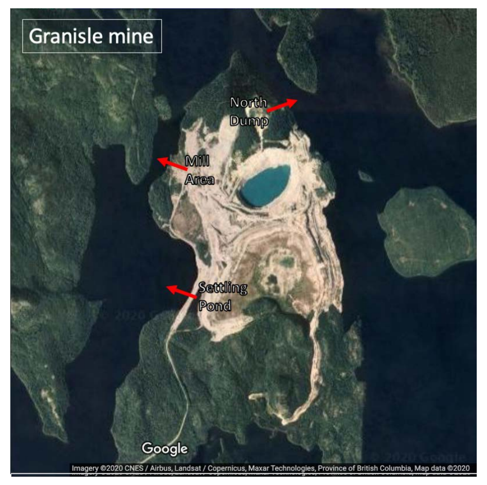
FIGURE 3. PASSIVE MINE-IMPACTED WATER DISCHARGES (RED ARROWS) FROM GRANISLE MINE INTO BABINE LAKE.

There are no volume or quality permit limits on any Granisle mine discharges, despite being untreated, potentially containing ARD, and often having surface flows into Babine Lake (Glencore 2018b). Permits do require Glencore to sample discharge quality from each area in Spring, Summer, and Autumn. Surface flows at North Dump and Mill Area are documented qualitatively using photographs, but actual discharge volumes are not quantified. Lethality of some Granisle mine discharges to aquatic invertebrates (i.e., Daphnia magna ) is tested, but none of Granisle's discharges are tested for lethality to rainbow trout or other fishes (Glencore 2018b).